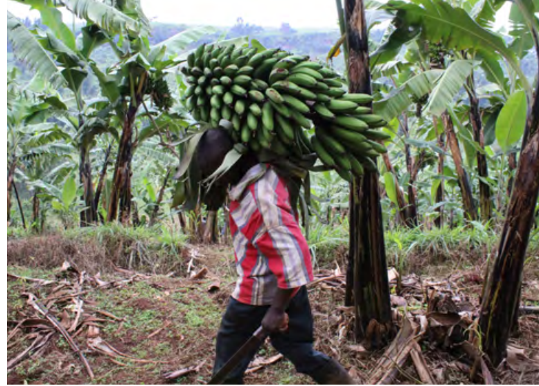
Man harvesting plantain

To design and implement EbA appropriately, the participation of all relevant stakeholders at the target site (e.g. farmers, women, indigenous people) and in the wider region (e.g. Ministry of Agriculture) is required. Their timely and continuous engagement is essential for the success of EbA, as they are the ones who have the knowledge, experience, capacities, and resources. It is important to acknowledge that the local stakeholders can contribute to the long-term impact of the EbA measures implemented after the conclusion of any project, hence it is essential to work with them from the start.