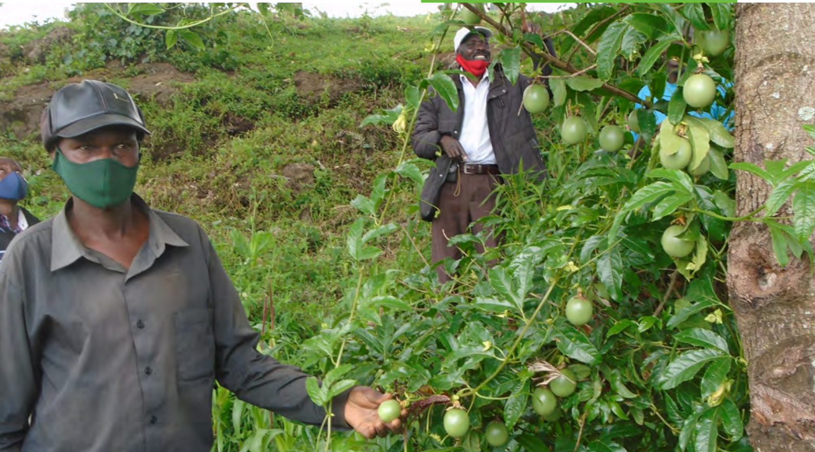
Farmers showcasing passion fruits due for harvest