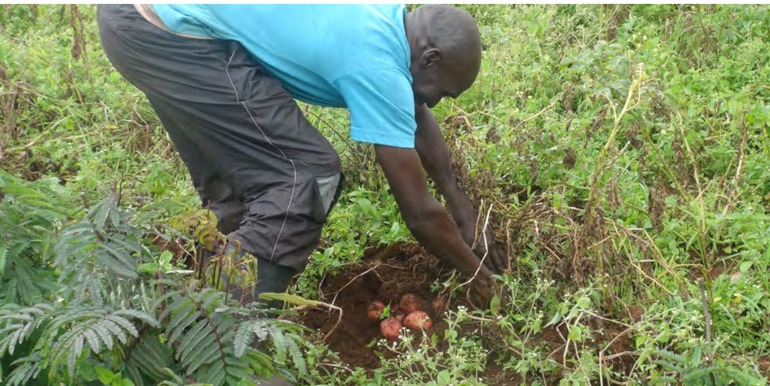
Picture of farmer harvesting potatoes in Kwoti Sub County